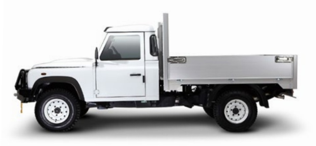
130 Chassis Cab Drop Side / Tipper

Jaguar Land Rover Limited Registered Office: Abbey Road, Whitley, Coventry CV3 4LF, United Kingdom.