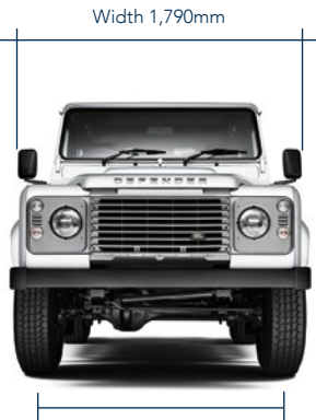
Track width 1,486mm