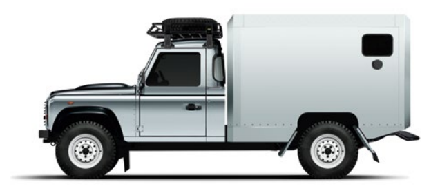
130 Cash in Transit