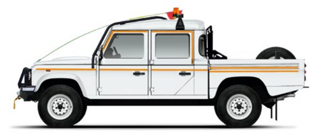
130 Double Cab High Capacity Pick Up

For commercial or market legislative reasons not all Defender Professional Vehicles are available in all markets. For further information, please contact your Land Rover Dealer or visit www.landrover.com/professional