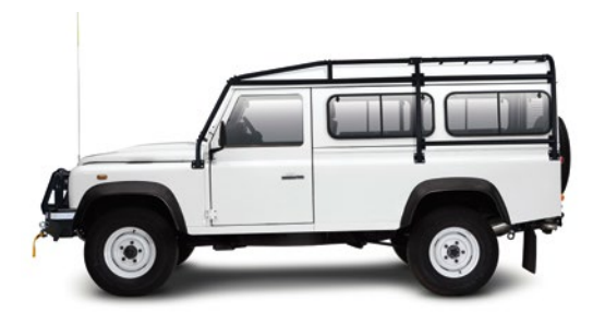
110 Hard Top Personnel Carrier