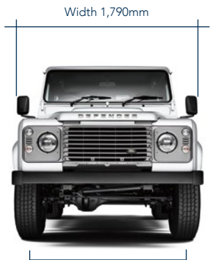
Track width 1,486mm